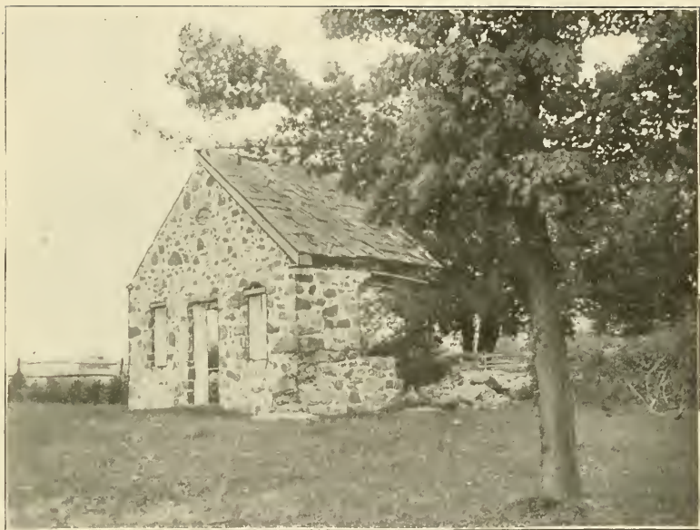
THE TALLEY SCHOOL HOUSE.